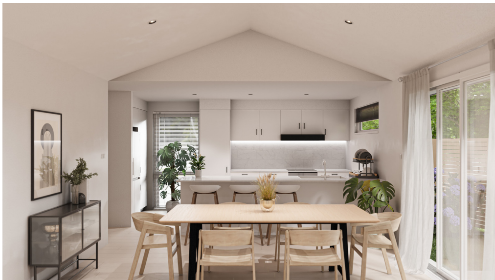
KITCHEN DINING VISUALIZATION

https://tailoredhomes.co.nz/ TailoredHomes NZ Unit 2/303 Blenheim Road, Upper Riccarton Christchurch